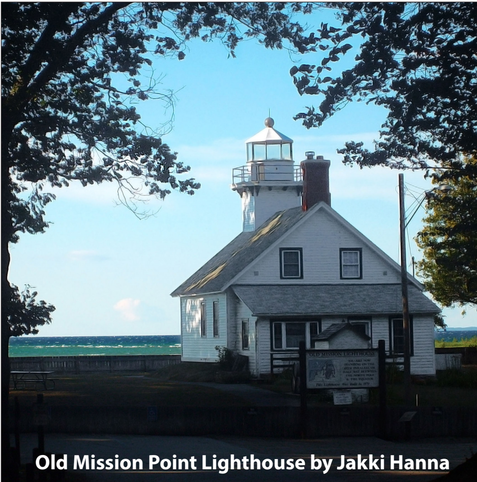
Old Mission Point Lighthouse